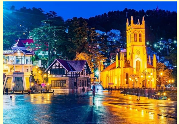
Christ Church, Shimla