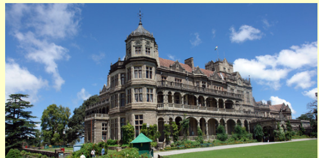
Viceregal Lodge, Shimla