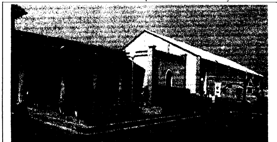
Tata Krishi Vikas Kendra