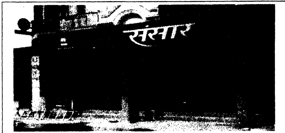
Tata Kisan Sansar

The pilot was started in two places viz. Babrala and Ujhani. The model is structured as hub and spoke model. The hub acts as Resource Centre (RC) to cater to the needs of the TKS (spokes) in their vicinity.